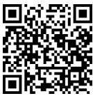
X600 SERVER 3D demo