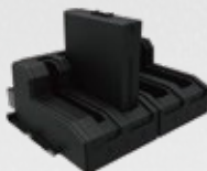
4-bay Battery Charger